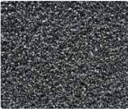
6 mm Metal

We provide expert quality checking on all our products. We never compromise the quality which we deliver to you and Supply Material according to customer need.