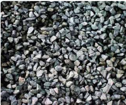
20 mm Black