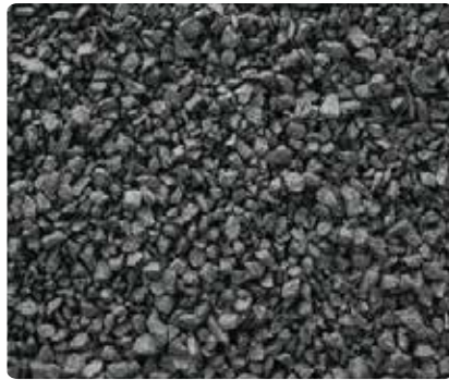
10 mm Metal