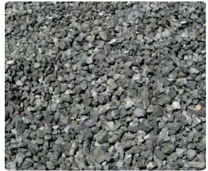
12 mm Metal