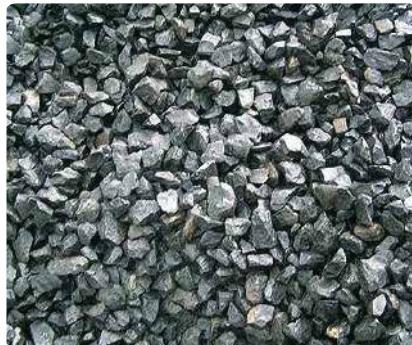
40 mm Metal